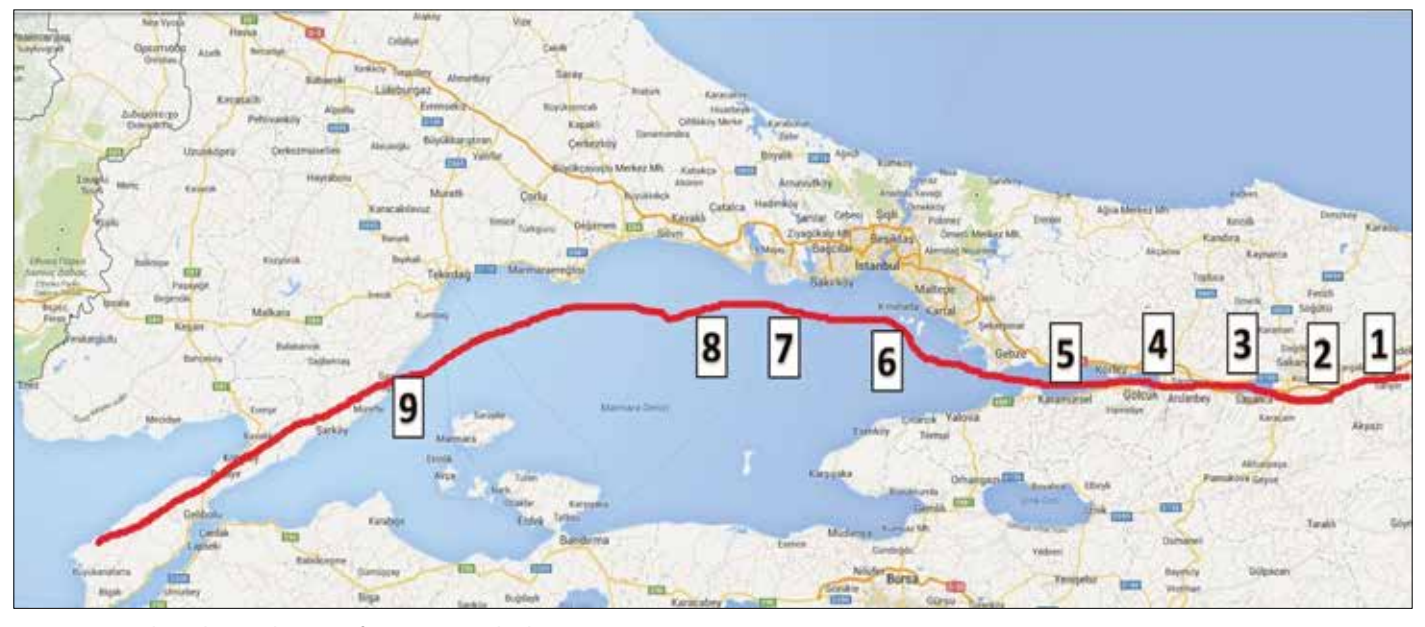
Figure 1. Earthquakes in the Sea of Marmara in the last 500 years